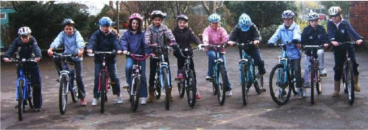
P6 improving their cycling skills

Bikeability is the latest Cycling Proficiency test, designed to give children the skills and confidence to ride their bikes on today's roads. In order to receive their awards, children have to participate in the Government approved National Standard for Cycle Training which was launched in Staffordshire last year. It was the turn of our current Year 6 students to participate in the Staffordshire County Council run course last week.