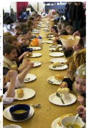
A new approach to school lunch