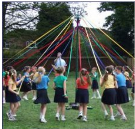
Children from Primary 2-6 participating at St. Michaels Church Flower Festival on Friday 9th May.