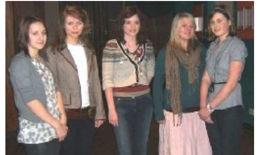
The 'Famous Five'

They are now eagerly awaiting the arrival of their invitations to St James' Palace for the official presentation of their Gold award certificates.