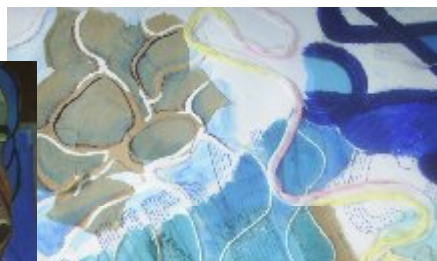
Examples of students' work