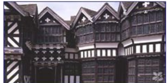
Little Moreton Hall: Cheshire's most iconic black & white house.

At lunchtime everyone enjoyed the authentic Tudor lunch, including chicken legs, ginger biscuits and ginger beer, which concluded a truly wonderful and memorable day.