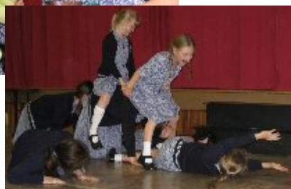
Students engaged in dragon drama