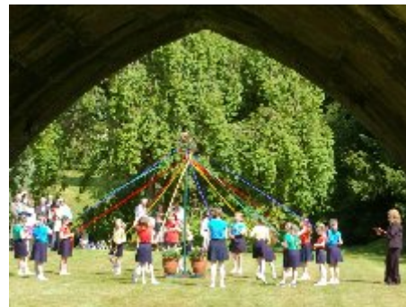
Prep Department Maypole Dancing Team