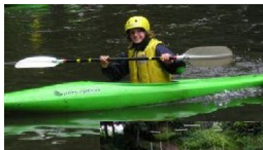
Students enjoying themselves on the water

the girls were paddling quite confidently and competently, some even attempting the slalom poles.