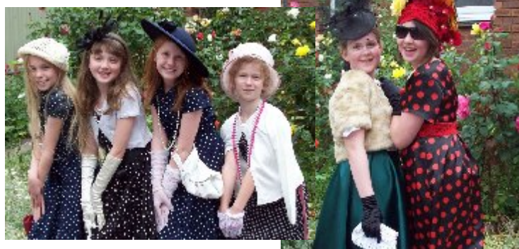
Students from P3-P6 getting into the spirit