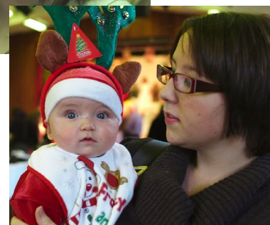
Guests enjoying the festivities at the Christmas Fayre.